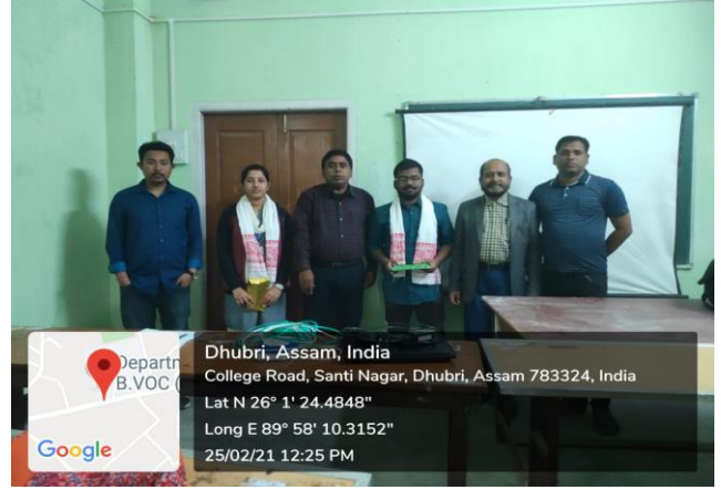
Photos of the programme